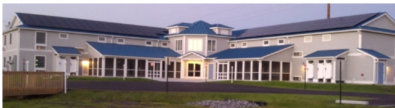
Alexander Campbell Hall Dorm & Conference Center

Located in Bethany Beach, DE, just two blocks from the Atlantic Ocean, this full-service church camp, conference, and retreat center has capacity for up to 80 guests. We have three types of sleeping rooms (dorm rooms, family rooms, and new ADA rooms) spread between three buildings, including our converted beach house. The Center has a chapel, dining hall, several meeting rooms, a large playground, and plenty of open space.